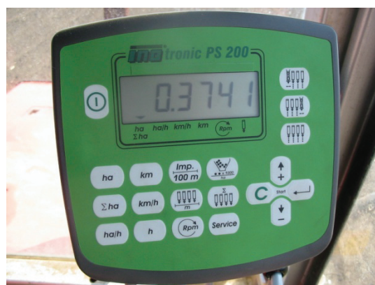
2b: Control unit of sowing electronic control