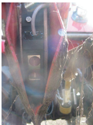
2a: Position of the sensor

The described seed drill was attached to IMT 565 tractor which technical and exploitation characteristics met the requirements of the seed drill. All important working parameters were adjusted and checked (number of PTO rotations, 540 rpm), as