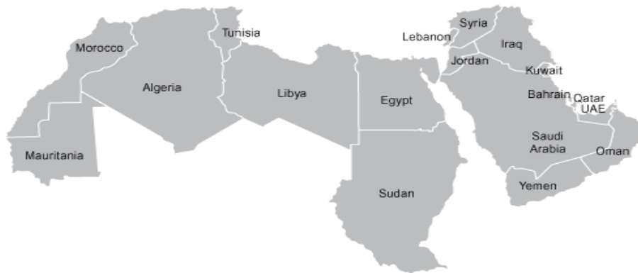
1: Middle East and North Africa

A., 2010). The region's per capita renewable water is projected to fall to below 500 cubic meters by 2030, compared with a world average of 4 800 cubic meters per capita and the situation could be aggravated by climate change (Abdel F., 2008).