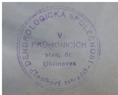
3: Stamp of the Dendrological Society in Průhonice (Club Garden)